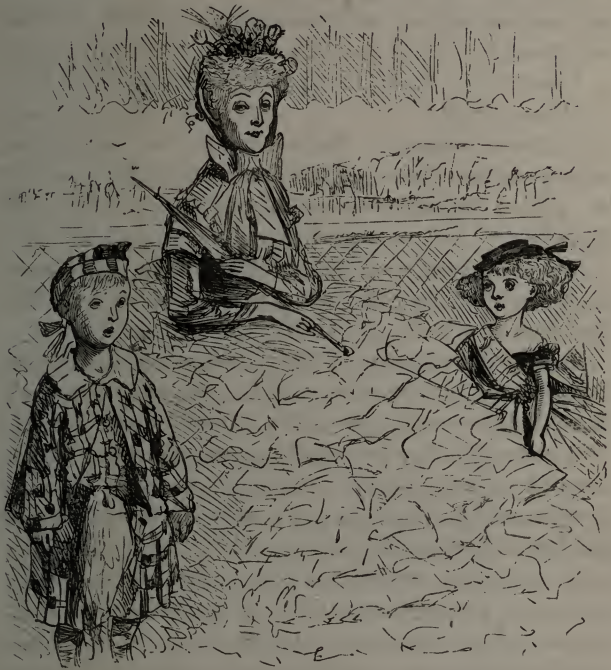
MRS. SALTONSTALL AND FAMILY.

more operative than before, sat on stools eating bonbons , while a French maid and the African footman hovered in the background.